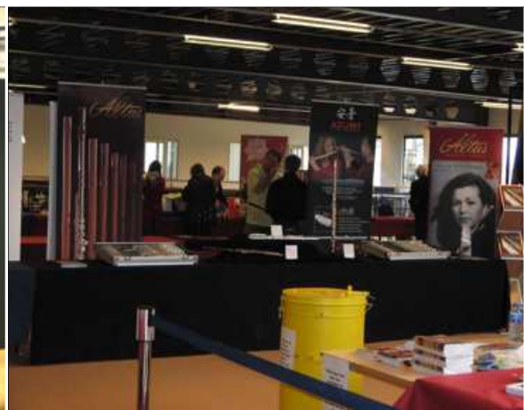
.... ein umfangreiches Angebot führender Flötenhersteller